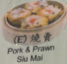
(E) 燒賣 Pork & Prawn Siu Mai