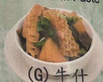
(G) 牛什 Mixed Beef Trips w Turnip