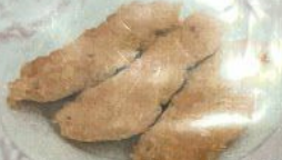
(G) 蝦腐皮卷 Prawn in Bean Curd Rolls