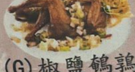
(G) 椒鹽鶴鶉 Salt & Pepper Quail