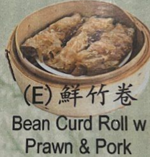
(E) 鮮竹卷 Bean Curd Roll w Prawn & Pork