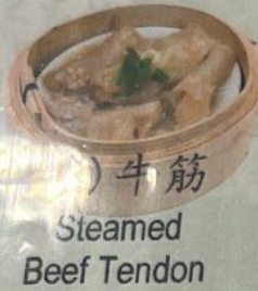
(L) 牛筋 Steamed Beef Tendon