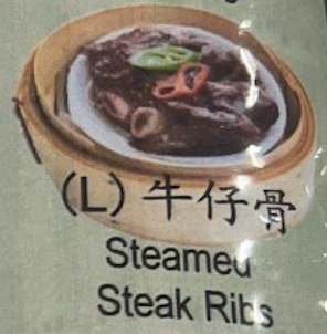
(L) 牛仔骨 Steamed Steak Ribs