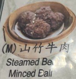
(M) 山竹牛肉 Steamed Beef Minced Ball