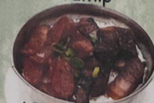
(G) 臘味飯 Steamed Rice w Chinese Bacon & Sausage