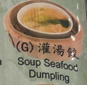
(G) 灌湯餃 Soup Seafood Dumpling