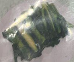
(2xM) 油菜 Chinese Vegetable Oyster Sauce