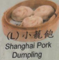
(L) 小籠飽 Shanghai Pork Dumpling