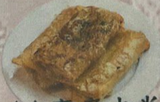
(M) 齋腐皮卷 Vegetarian Bean Curd Rolls