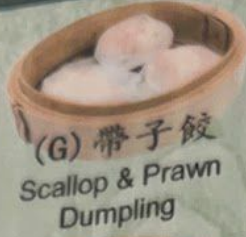
(G) 帶子餃 Scallop & Prawn Dumpling