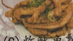
(G) 炸魷魚鬚 Deep Fried Squid Tentacles