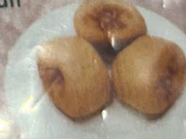
(S) 炸銀絲 Deep Fried Mini Buns

ALL PHOTOS ARE FOR ILLUSTRATION PURPOSE ONLY