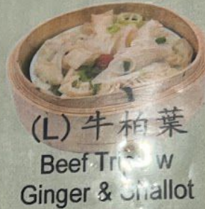
(L) 牛柏葉 Beef Tripe w Ginger & Shallot