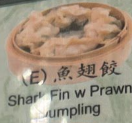
(E) 魚翅餃 Shark Fin w Prawn Dumpling