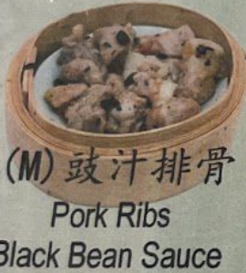
(M) 豉汁排骨 Pork Ribs Black Bean Sauce