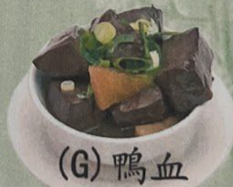
(G) 鴨血 Duck's Blood Jelly w Turnip