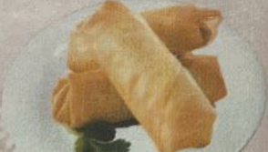
(M) 素食春卷 Vegetarian Spring Rolls