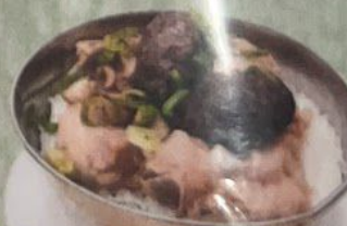
(G) 香菇蒸雞 Steamed Rice w Chicken & Mushroom

ALL PHOTOS ARE FOR ILLUSTRATION PURPOSE ONLY