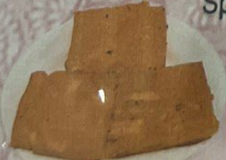
(S) 煎馬蹄糕 Water Chestnut Pudding