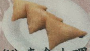
(M) 素食咖喱角 Vegetarian Curry Puff