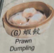
(G) 蝦餃 Prawn Dumpling