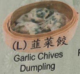
(L) 韭菜餃 Garlic Chives Dumpling