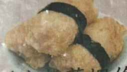
(G) 紫菜蝦條 Deep Fried Prawn & Seaweed Rolls