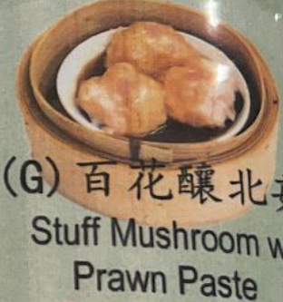
(G) 百花釀北菇 Stuff Mushroom w Prawn Paste