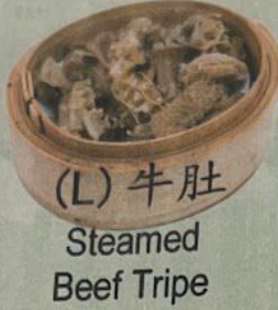
(L) 牛肚 Steamed Beef Tripe