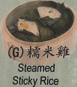
(G) 糯米雞 Steamed Sticky Rice