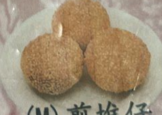
(M) 煎堆仔 Sesame Seed Balls w Red Bean