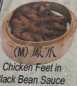
(M) 鳳爪 Chicken Feet in Black Bean Sauce