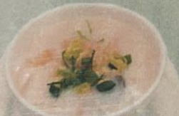
(M) 皮蛋瘦肉粥 Century Egg w Pork Congee