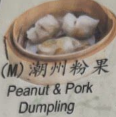
(M) 潮州粉果 Peanut & Pork Dumpling