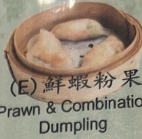
(E) 鮮蝦粉果 Prawn & Combination Dumpling