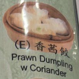
(E) 香茜餃 Prawn Dumpling w Coriander