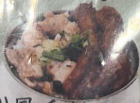
(G) 鳳爪排骨飯 Steamed Rice w Chicken Feet & Pork Ribs