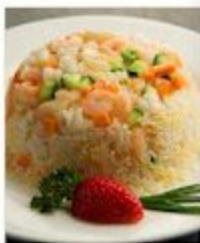
海鲜炒饭 $18 Fried Rice w/ Seafood, Cauliflower