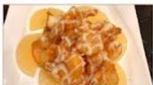
菠萝虾球 $29.8 Pineapple Prawns w/ Pineapple and Mayonnaise