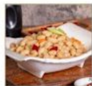
盐水花生 $9.9 Boiled Peanut w/ Salt