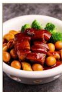
年糕红烧肉 $32 Braised Pork Belly with Quail and Sticky Rice Cake