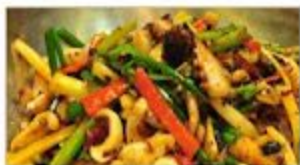
干锅鱿鱼须 $28 Griddle Cooked Squid Tentacles