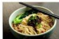
担担面 $12 Spiced Pork Noodles w/ Spiced Pork, Green Spices, Spices