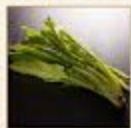
时令蔬菜 $17.5 Stir Fried Vegetables w/ Spiced Pork / Spiced Sauce / Chili