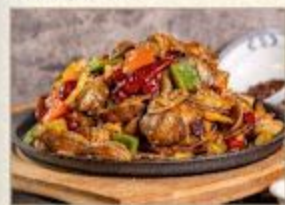
辣炒花蛤 $26.8 Stir Fried Clams w/ Hot Chili Sauce