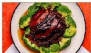
芽菜扣肉 $27.8 Steamed Pork Belly w/ Special Preserved Veggies