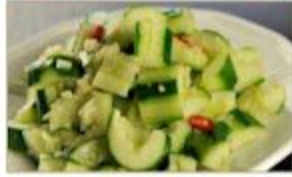
蒜蓉拍黄瓜 $10.8 Cucumber Salad w/ Chopped Garlic