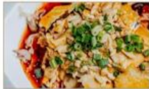
口水鸡 $16.8 Chicken Slices w/ Green Onion, Tofu and Chili Oil