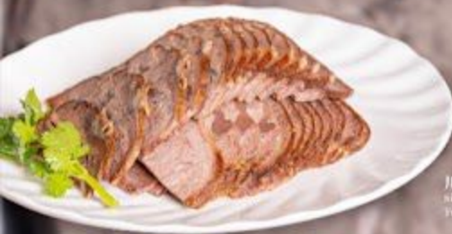
川式卤牛腱肉 $18.8 Sichuan Braised Beef Tendon Slices