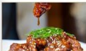
虎皮牛肉 $28 Crispy Beef in Sweet and Sour Sauce