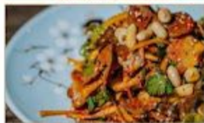
夫妻肺片 $18.8 Sliced Beef, Beef Tongue and Tripe w/ Chili Sauce