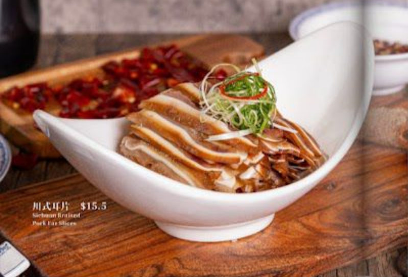
川式耳片 $15.5 Sichuan Braised Pork Ear Slices