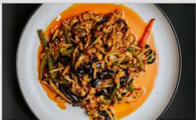
鱼香肉丝 $23.8 Stir Fried Shredded Pork w/ Chili and Garlic Sauce