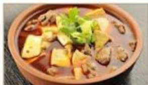
豆花牛肉 $24 Beef and Bean-Curd w/ Special Chinese Spices