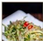
蒜蓉黄瓜海蜇丝 $15.8 Shredded Jelly Fish and Cucumber Salad