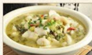
山椒酸菜鱼/乌鱼 $34.9 / $42.9 Steamed Bass Fillets or Snake-head Fillets w/ Pickled Chili and Cabbage