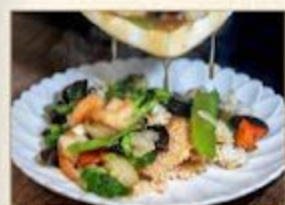
海鲜锅巴 $36 Seafood Combination on Steaming Rice Crust