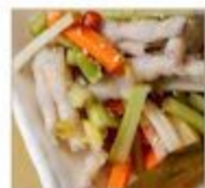
泡椒凤爪 $13.8 Pickled Chicken Feet w/ Pickled Vegetables