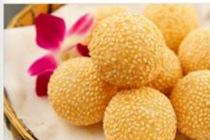
芝麻肉包 $2.3/$10 Rice, Meat w/ Sesame