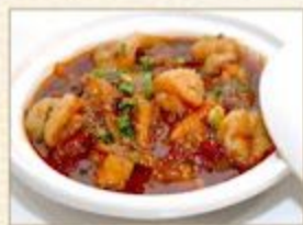
鱼香茄子虾 $27.8 Fried Eggplant w/ Prawns in Garlic Sauce 鱼香茄子 $19 Deep Fried Eggplant w/ Garlic Sauce