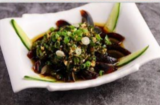
烧椒皮蛋 $13.8 Preserved Egg w/ Cucumber Slices in Spicy and Sour Sauce