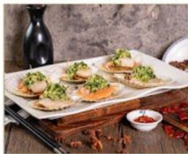
蒜蓉粉丝蒸扇贝 (时价, 40粒)