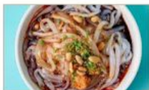
酸辣凉粉 $10.8 Sichuan Green Bean Noodles w/ Sour and Spicy Sauce