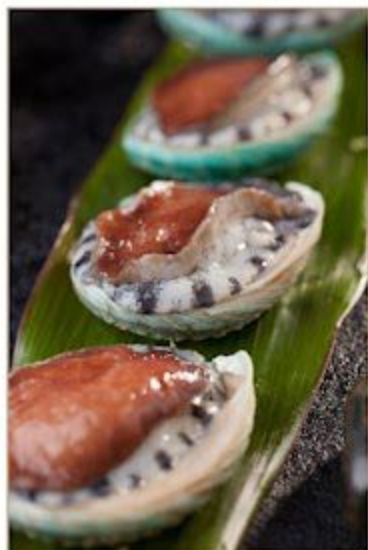
鲍鱼 (时价, 40粒)