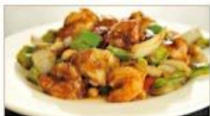
宫保虾球 $29.8 Kung Pao Prawns w/ Roasted Peanuts and Chili Sauce