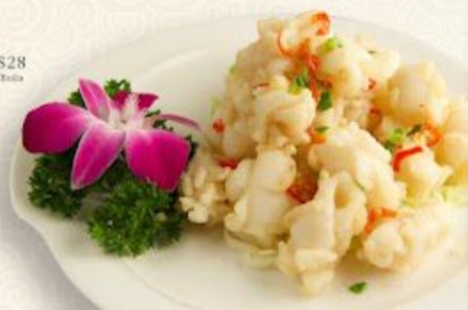
椒盐鱿鱼卷 $28 Salt and Pepper Calamari Rolls