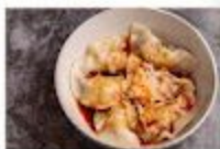
辣水饺 $12 Spiced Pork Dumplings w/ Spiced Pork, Spices, Sesame