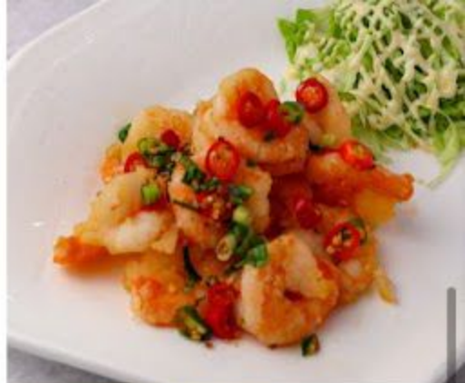
椒盐虾球 $29.8 Salt and Pepper Tiger Prawns