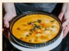
芙蓉花蛤 $26 Steamed Eggplant w/ Clams