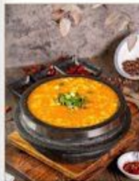
鲜蘑豆腐 $19.8 Braised Tofu w/ Wild Tofu, Tofu