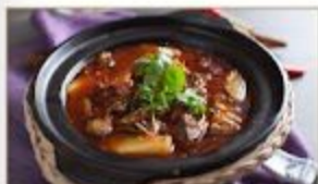
土豆烧牛腩 $26 Braised Beef Brisket w/ Potato