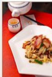
鸿运东坡肘子 $32 Dropps Pork Knuckle w/ Ginger and Chili Sauce