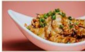
蒜泥白肉 $15.8 Sliced Braised Pork w/ Garlic and Chili Sauce