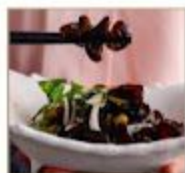
香菜拌木耳 $10.8 Cold Fungus w/ Coriander in Spicy and Sour Sauce