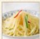
土豆丝 $16.5 Stir Fried Potato Strips w/ Spiced Pork, Carrot & Peas w/ Szechuan Sauce