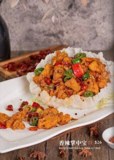
香辣掌中宝 $26 Deep Fried Chicken Palm n/ Chili