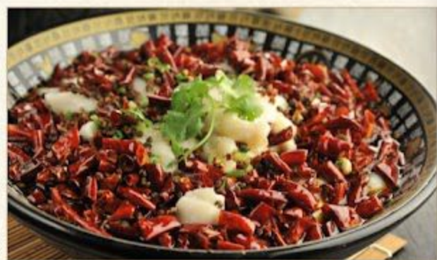
沸腾鱼/乌鱼 $39.9 / $47.9 Chef's Special Bass Fillets or Snake-head Fillets in Hot Chili Oil