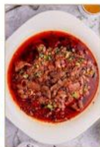
水煮牛肉 $27.8 Poched Beef in Spicy Sauce w/ Chinese Cabbage