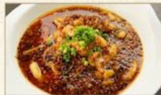
水煮鱼/乌鱼 $34.9 / $42.9 Bass Fillets or Snake-head Fillets in Spicy Sauce w/ Cabbage