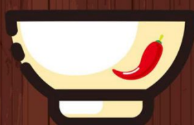
酸辣 Sour & Spicy