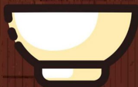
叻沙 Laksa *non-spicy*