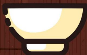
酸菜 Sour pickles *non-spicy*