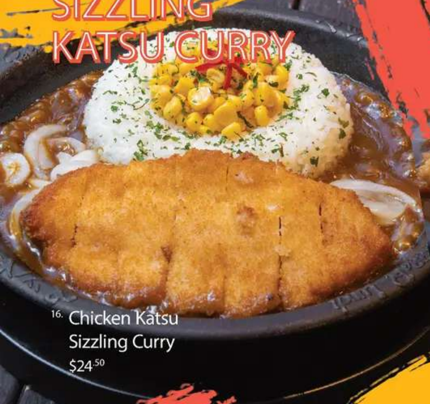
16. Chicken Katsu Sizzling Curry $24 .50