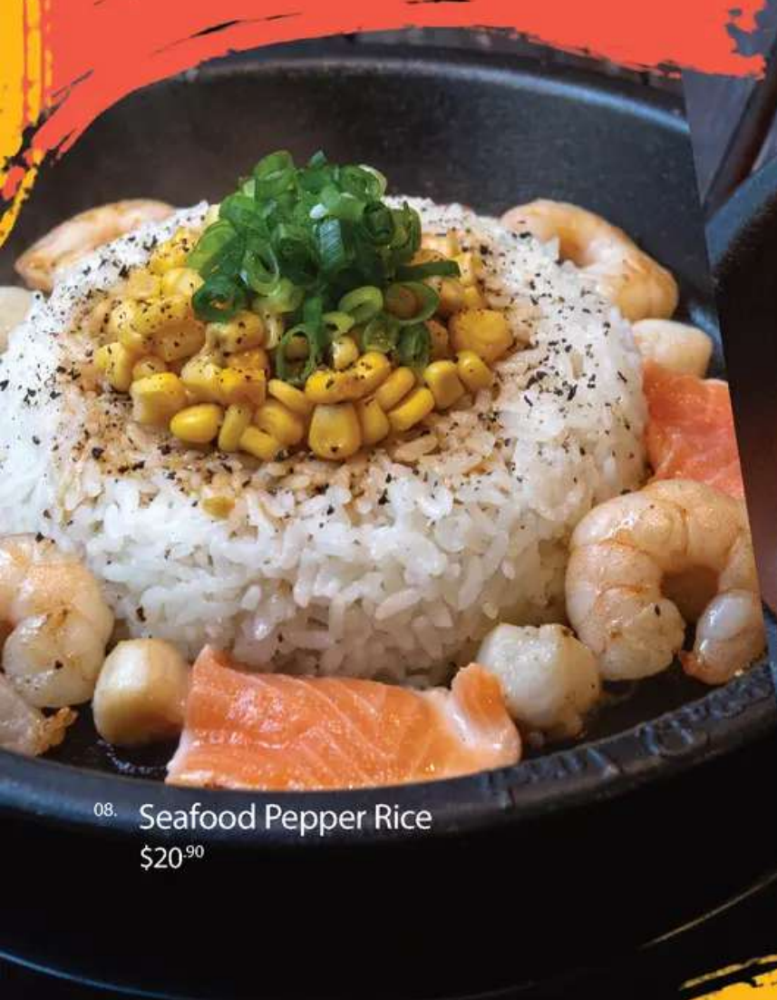
08. Seafood Pepper Rice $20. 90