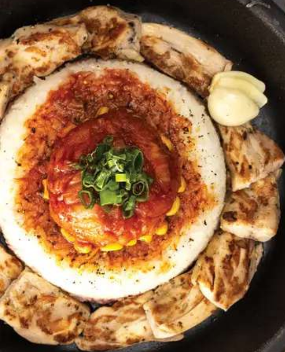
03. Kimchi Chicken Pepper Rice