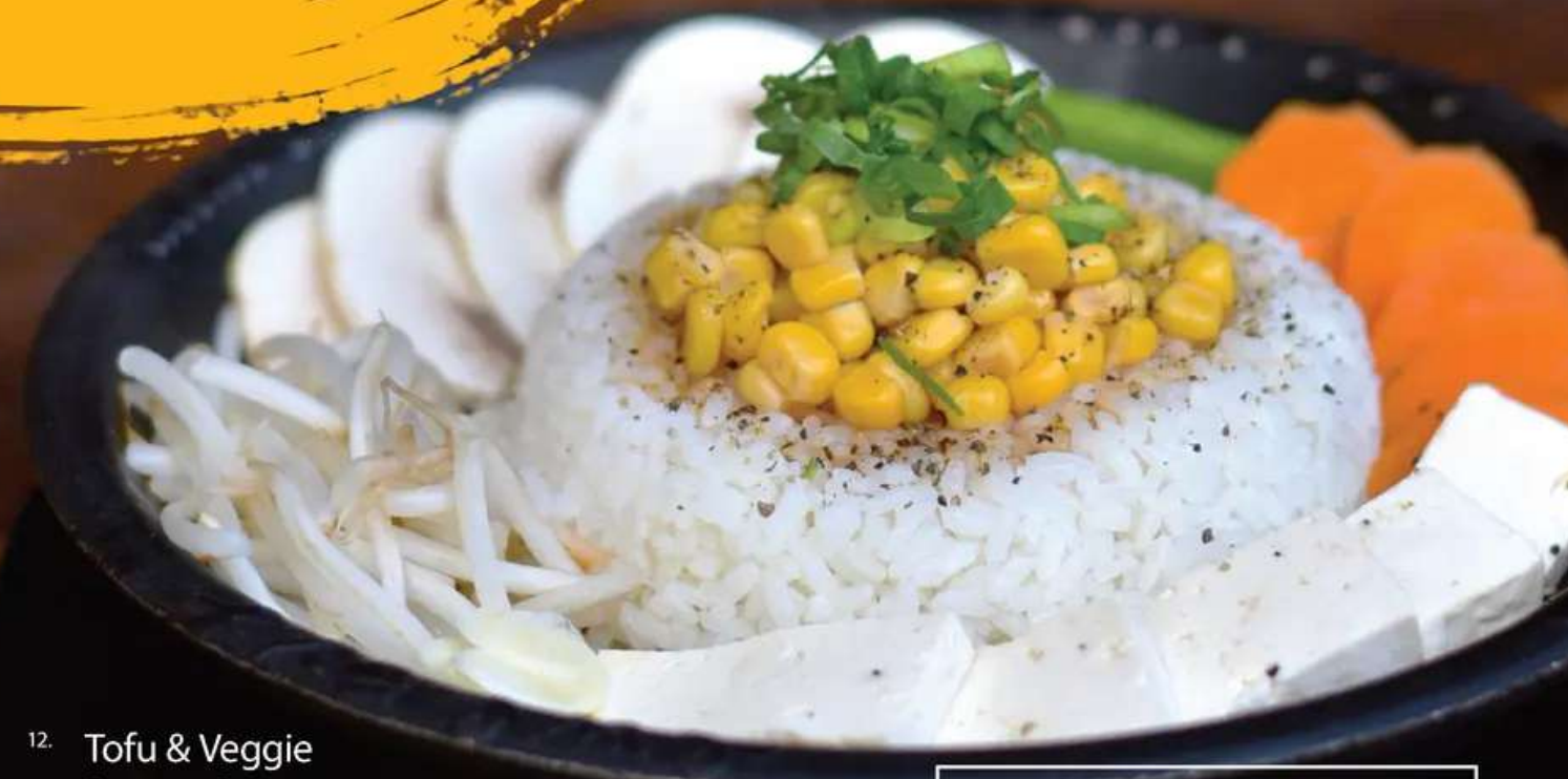
12. Tofu & Veggie Pepper Rice $14 90