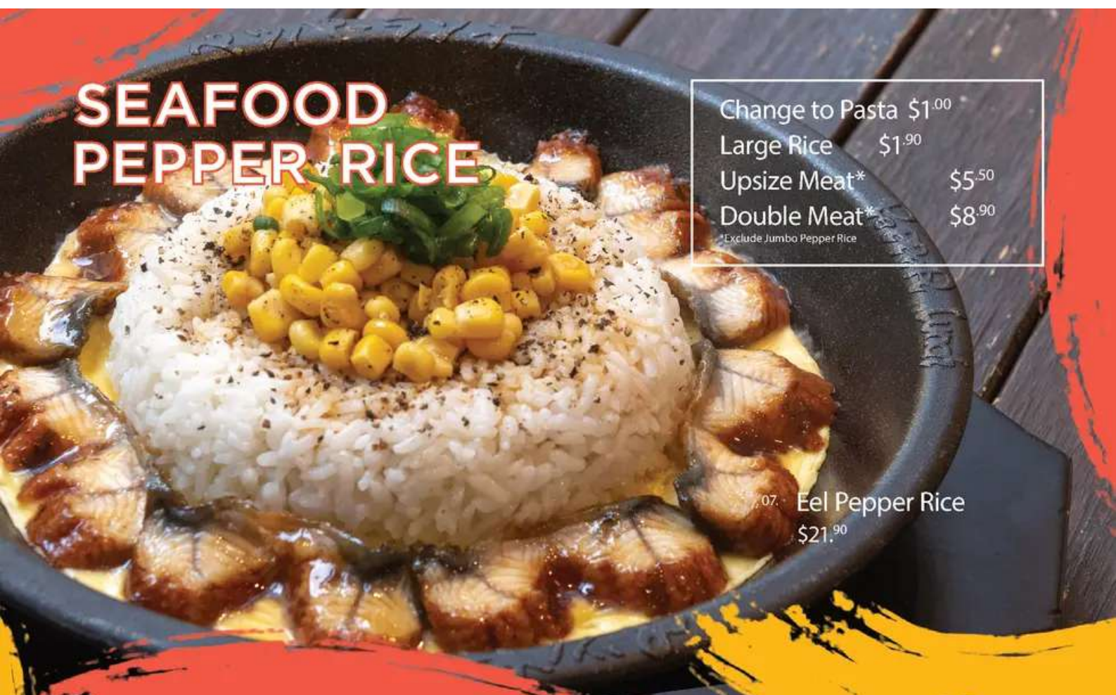
07. Eel Pepper Rice $21. 90