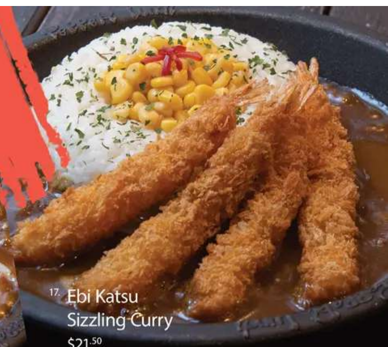
17. Ebi Katsu Sizzling Curry $21 .50