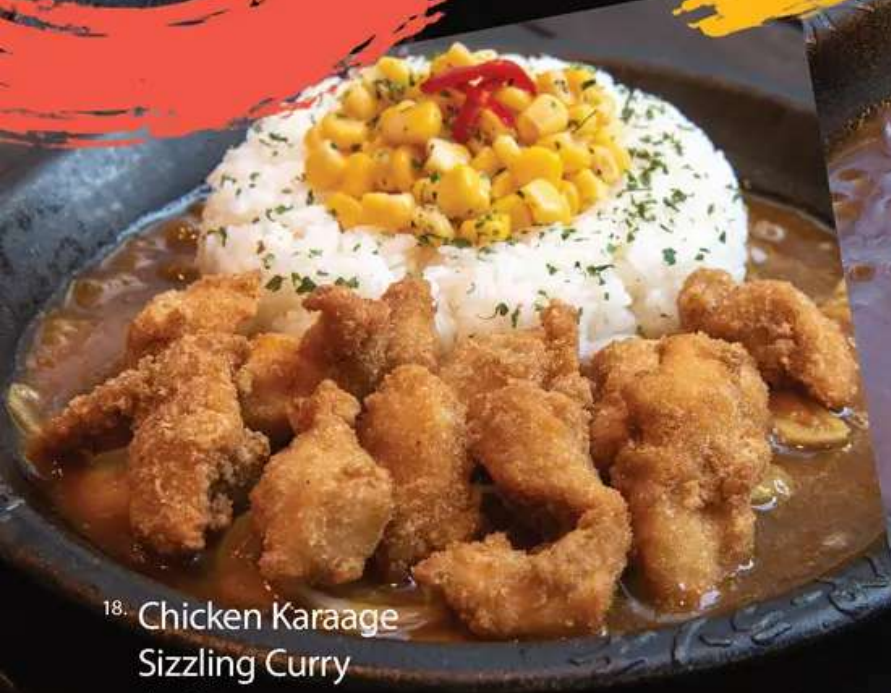
18. Chicken Karaage Sizzling Curry $20 .50