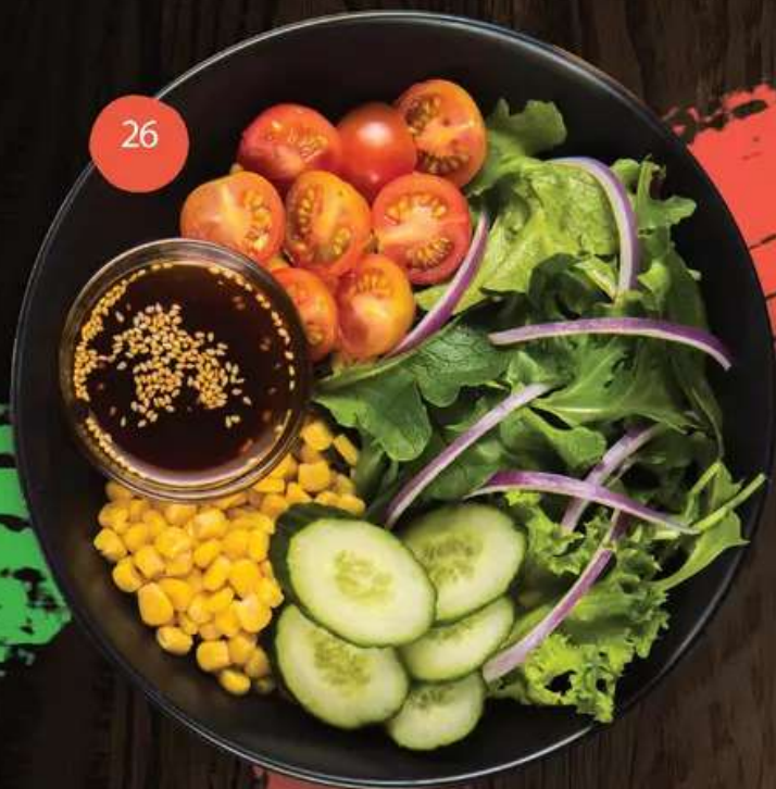
26. Pepper Salad $12. 50

Pepper Salad with Chicken / Hamburg $19. 50