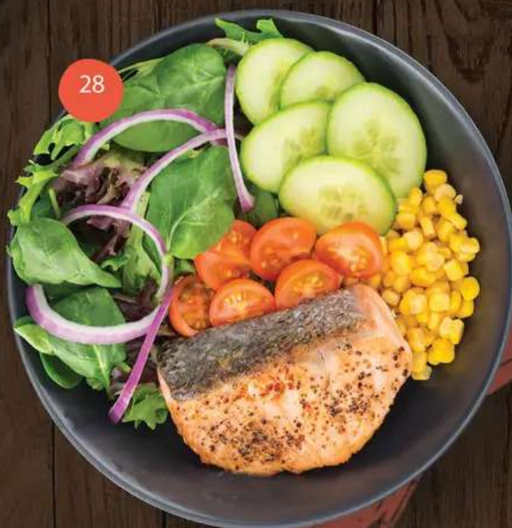
28. Pepper Salad with Salmon $23. 50