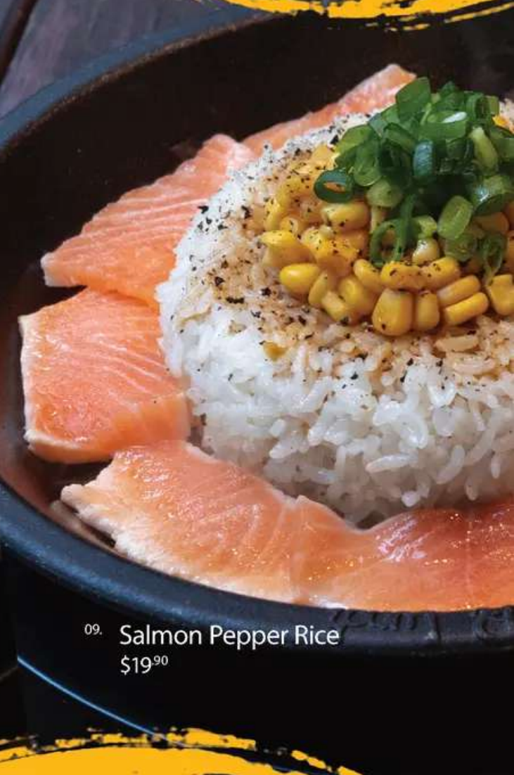
09. Salmon Pepper Rice $19. 90