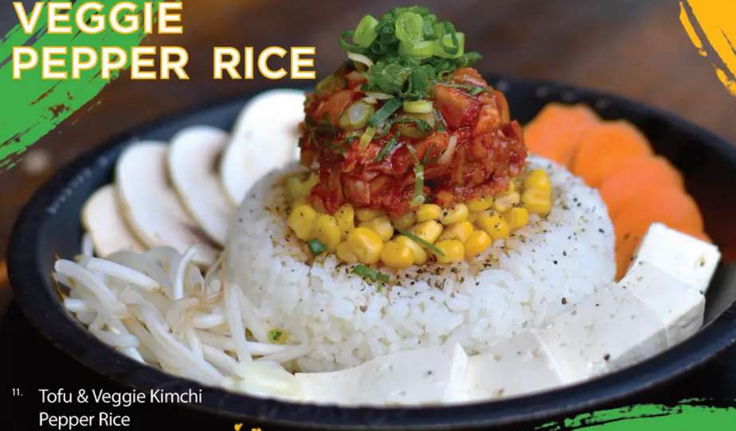
11. Tofu & Veggie Kimchi Pepper Rice $16 50