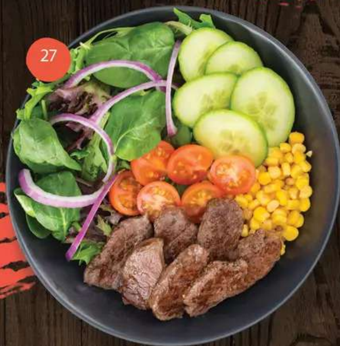
27. Pepper Salad with Premium Cut Steak $23. 50

Pepper Salad with Chicken / Hamburg $19. 50