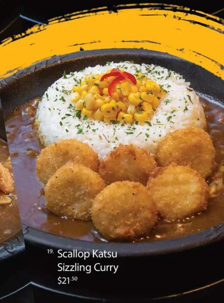
19. Scallop Katsu Sizzling Curry $21 .50