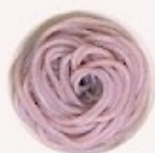
Red Rice Noodles