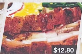
脆皮燒肉飯 Crispy Roast Pork with Rice