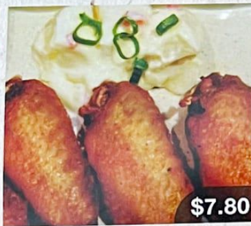
蒜香雞翼配薯條 Chicken Wings with chips (4)