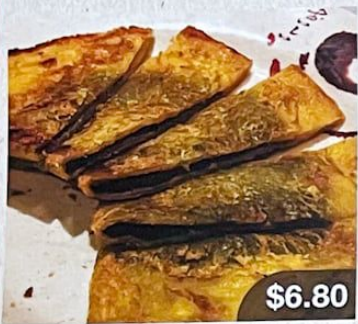
豆沙窩餅 Red Bean Pancake