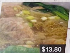
雲吞麵 Wonton with egg noodle soup