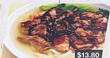
日式雞扒湯烏冬 Japanese Teriyaki Chicken with Udon Noodle Soup