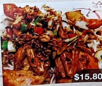
椒鹽鷄鶉 Salt & Pepper Quail (2)