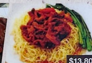
炸醬撈麵 Stirred noodles with spicy minced pork sauce