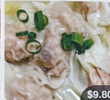
鮮蝦淨雲吞 Prawn Wonton Soup (6)