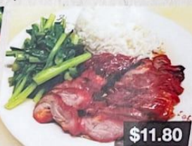
招牌蜜汁叉燒飯 BBQ Pork with Rice