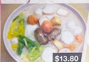
魚湯五寶米線 Five Treasures Rice Noodle Soup