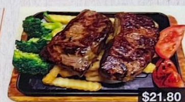
鐵板西冷牛扒餐 Sizzling Sirloin Steak in Garlic OR Black Pepper Sauce