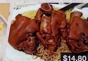
豬手撈麵 Stirred noodles with Pig's Trotter