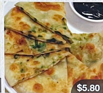
蔥油餅 Shallot Pancake