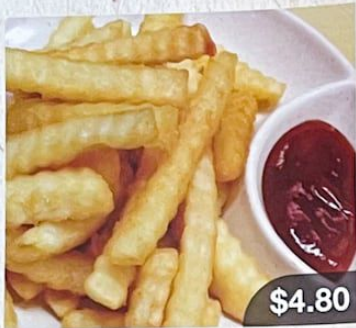
炸薯條 Potato Chips