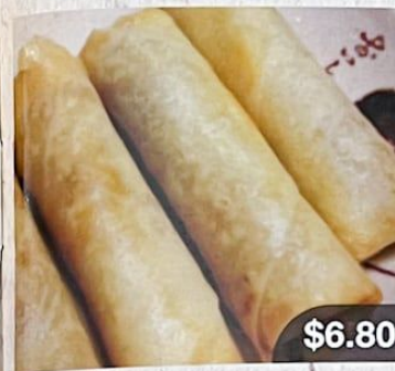
炸春卷 Spring Rolls (4)