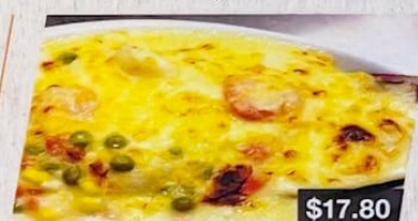
焗海鮮飯或意粉 Baked Seafood with Rice or Spaghetti