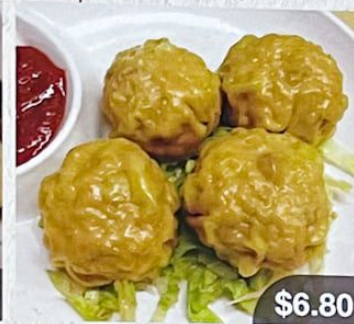
蒸點心 Steamed Dim Sim (4)