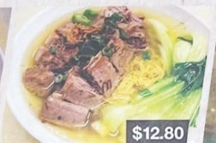
清湯牛腩湯麵 Beef Brisket with Egg Noodle Soup