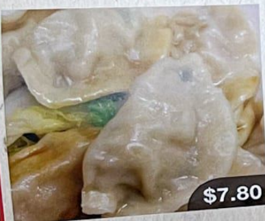
水餃 Steamed Pork Dumplings (8)