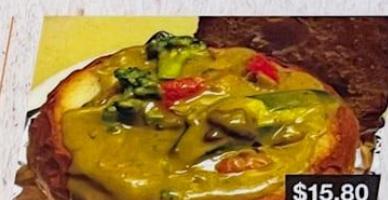
焗葡式咖喱雞農夫包 Baked Chicken with Portuguese Curry in Cobb Bread