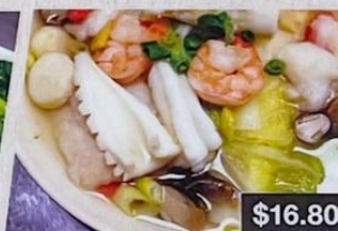
海鮮湯麵 Seafood with Egg Noodle Soup