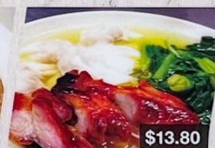
叉燒雲吞湯麵 BBQ Pork & Prawn Wonton with Egg Noodle Soup