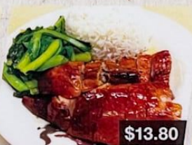
明爐燒鴨飯 BBQ Roast Duck with Rice