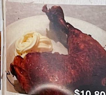
炸雞脾 Fried Chicken Maryland