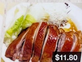
玫瑰豉油雞飯 Soya Sauce Chicken with Rice