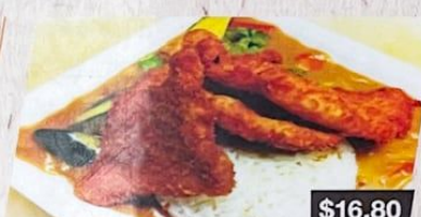
日式咖喱吉列魚/豬扒飯 Fish OR Pork Cutlet in Japanese Curry with Rice