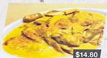
焗葡國雞飯或意粉 Baked Chicken in Portuguese Sauce with Rice or Spaghetti