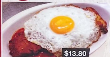
黃金飯 Pork Cutlet & Fried Egg with Fried Rice