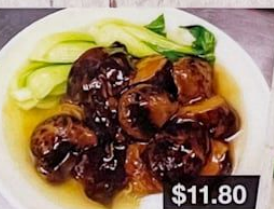
蠔皇冬菇湯麵 Chinese Mushrooms with Egg Noodle Soup