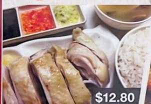
港式馳名海南雞飯 Hoi Nam Chicken Rice