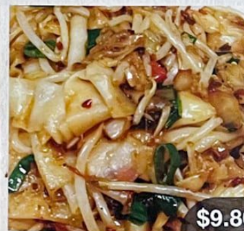
XO 醬炒腸粉 Stir Fried Rice Noodle Rolls in XO Sauce