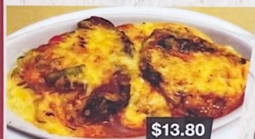
焗豬扒飯或意粉 Baked Pork Chop with Rice or Spaghetti