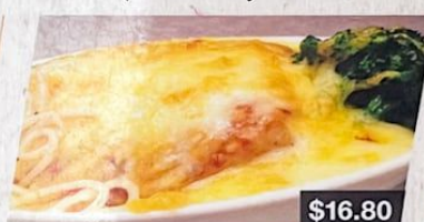
焗芝士石斑飯或意粉 Baked Fish Fillet in Creamy White Sauce with Rice or Spaghetti