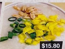
一品粥 Chef Special Congee