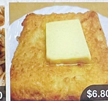
西多士 French Toast