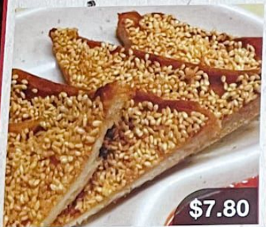
蝦多士 Sesame Prawn Toast (4)