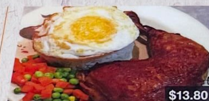
燴汁雞腩煎蛋飯或意粉 Fried Chicken Maryland & Fried Egg in Tomato Sauce with Rice