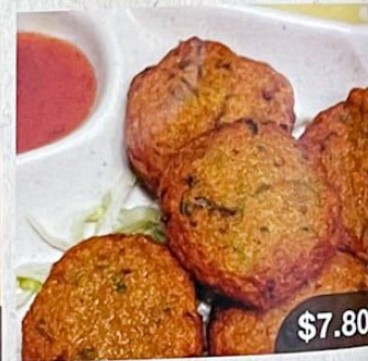
泰式炸魚餅 Thai Fish Cake (5)