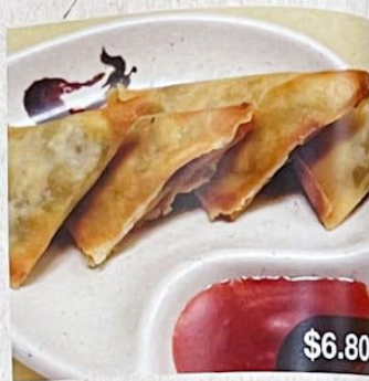
咖喱角 Curry Puffs (4)