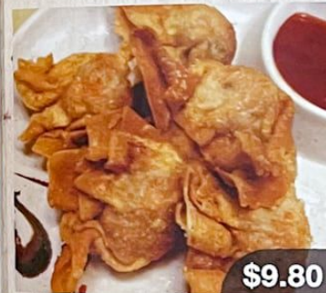
炸雲吞 Fried Prawn Wontons (5)