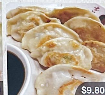
煎餃子 Pan-Fried Dumplings (8)