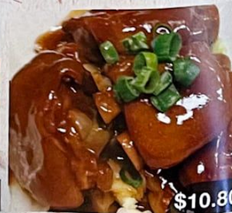
南乳豬手 Pig's Trotter in Red Beancurd Sauce